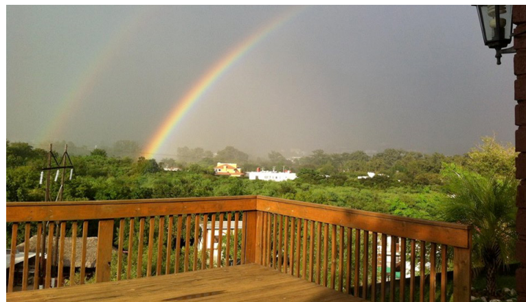
CASA HOGAR DOUGLAS