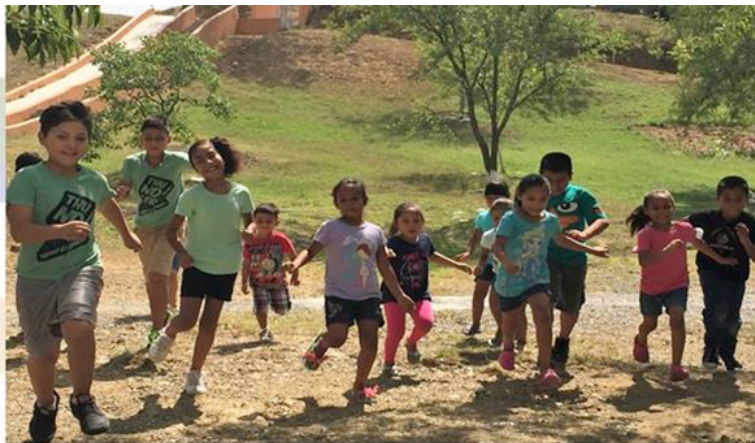
CHILDREN PLAY AT CASA HOGAR DOUGLAS

"How many loaves do you have?" Jesus asked. "Go and see." When they found out, they said, "Five—and two fish." ... "Taking the five loaves and the two fish and looking up to heaven, He gave thanks and broke the loaves. Then He gave them to His disciples to distribute to the [5000] people. He also divided the two fish among them all. They all ate and were satisfied."